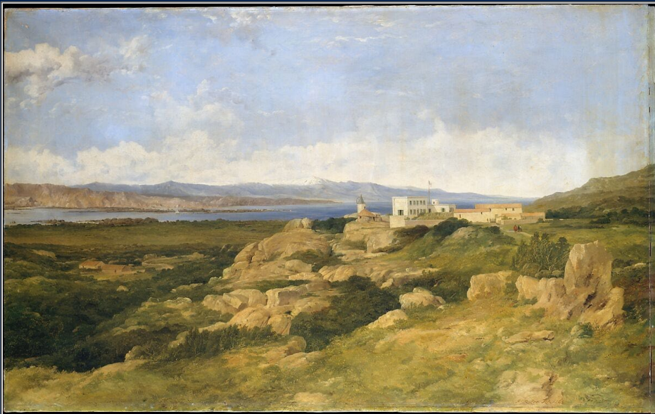
General Garibaldi's Residence at Caprera Frederick Richard Lee British 1865