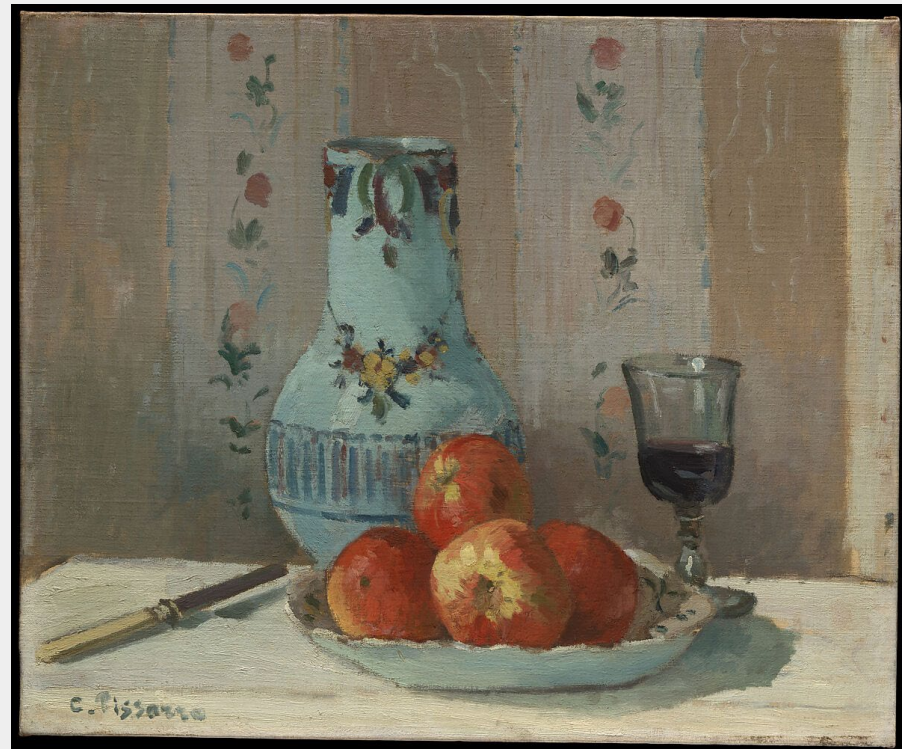
Still life with Apples and Pitcher Camille Pissarro French 1872