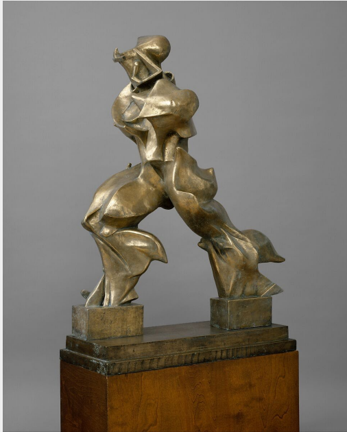
Unique Forms of Continuity in Space Umberto Boccioni Italian, 1913