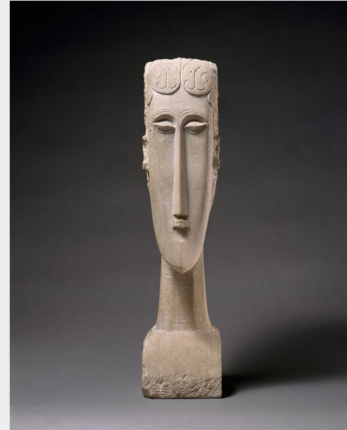
Woman's Head Amedeo Modigliani Italian, 1912